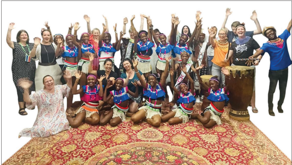
The Ipopeng Cultural Group is set to equip young people with arts and culture lessons during the winter schools’ holidays.

“ During school holidays, primary school children have nowhere to go and that creates a problem for them because their parents are at work, and they just wonder all over the streets. We believe that arts and culture lessons will provide them with a safe haven