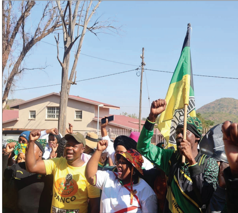
ANC members chanting outside the Sekhukhune Magistrate's Court during the court proceedings.