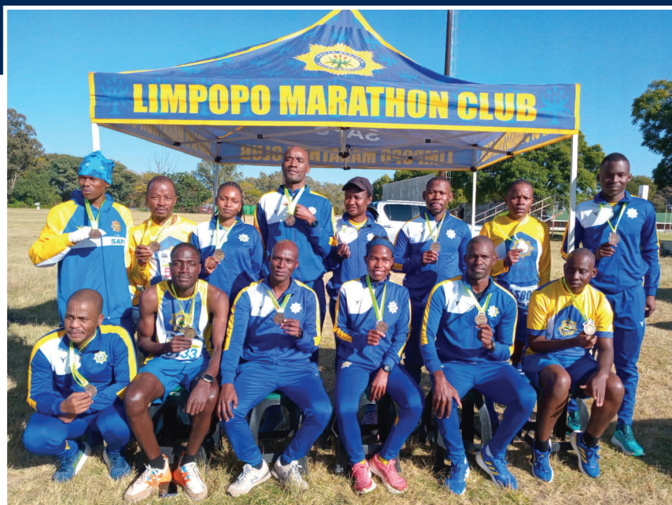
Members of the Limpopo Marathon Club impressed during the 2025 Mzansi Half Marathon which was held in Polokwane on Saturday 24 May.