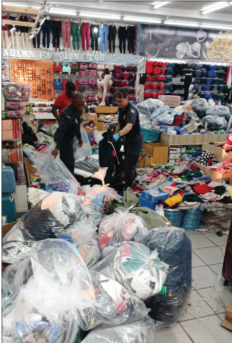
The goods that were confiscated by the multi-disciplinary law enforcement agencies during the raid at Burgersfort Town.

BURGERSFORT A collaborative effort between various multi-disciplinary law enforcement agencies, has resulted in the confiscation of counterfeit goods worth over R20 million in Burgersfort Town. Colonel Malesela Ledwaba, Limpopo Provincial Police Spokesperson, said the multi-million rand recovery was made during a police operation, conducted on Monday 26 and Wednesday 28 May 2025, involving members of the National Counterfeit Unit, the National Roving Team (TRT), Burgersfort SAPS, and Customs SARS. “More than 10 shops in Burgersfort Town were raided during the operations, and counterfeit goods, including clothing and cosmetics, were recovered. The total value of the recovered stock is estimated to