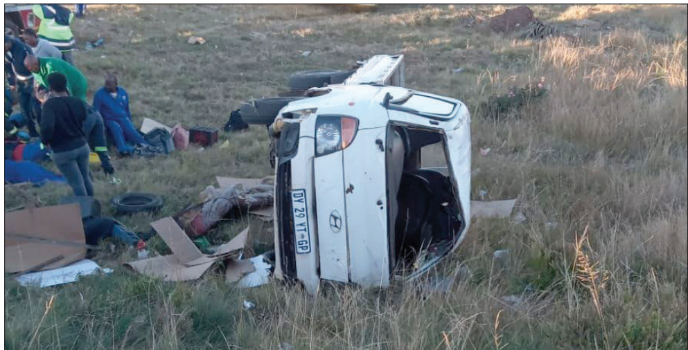
The Hyundai truck which overturned in Tafelkop while transporting farmworkers on Monday morning.