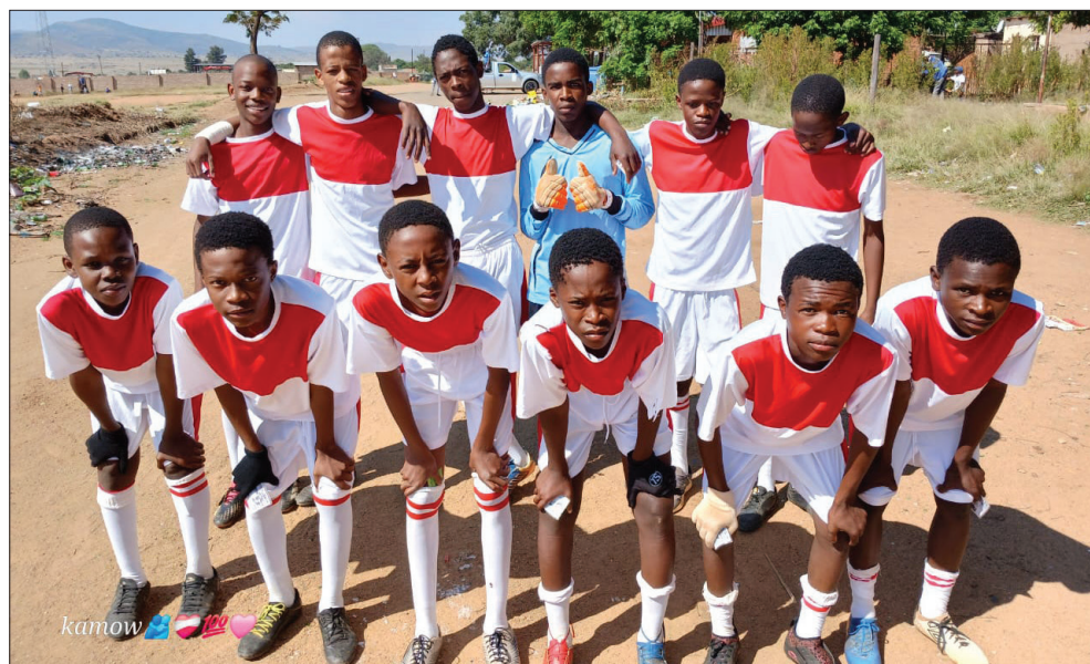
Blackpool FC players became victorious defeating Dithabaneng FC during the Mashadi Social Games organised at Maredi Sports Grounds in Jane Furse under the Makhuduthamaga LFA.

JANEFURSE - In a thrilling football match played at the Maredi Sports Grounds in Jane Furse on Sunday 1 June 2025, Blackpool FC, clad in their iconic red and whites, emerged victorious in the Mashadi Social Games, organised under Makhuduthamaga Local Football Association (LFA).