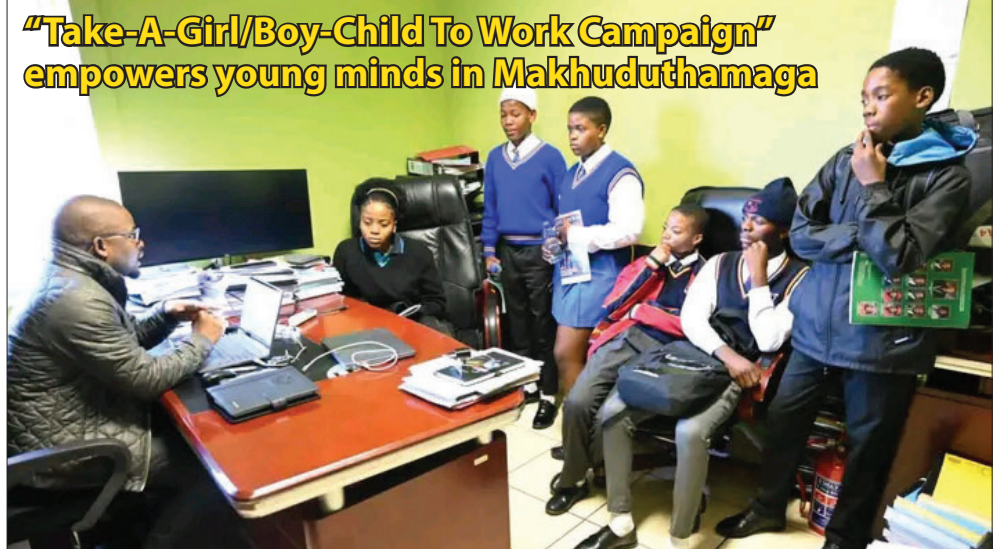
Pupils from Monamoleledi, Mangolwane, and Mantlatle Secondary Schools gaining valuable insights into the inner workings of MLM during the Take-A-Girl/Boy-Child To Work Campaign.

JANE FURSE - The Office of the Premier in Limpopo, in collaboration with Makhuduthamaga Local Municipality (MLM), have on Friday 30 May 2025 organised the "Take-A-Girl/Boy-Child To Work Campaign" at the MLM municipal offices in Jane Furse. The initiative aimed to expose learners to various career opportunities and provide them with a deeper understanding of how the municipality operates. Thirty learners from Monamoleledi, Mangolwane, and Mantlatle Secondary Schools participated in the campaign, gaining valuable insights into the inner workings of the municipality. During the programme, the pupils were afforded the opportunity to attend a special council meeting and visit various divisions of the municipality where they gained an understanding of financial management and budgeting. They learned about infrastructure development and project management where they were also exposed to the role of executive support in the municipality. The campaign's primary objective